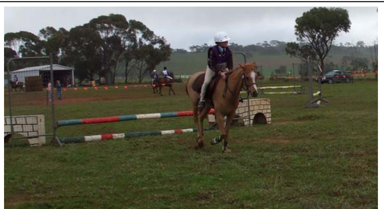
Me on Rocki at Monarto ODE in grade 5 show jumping.